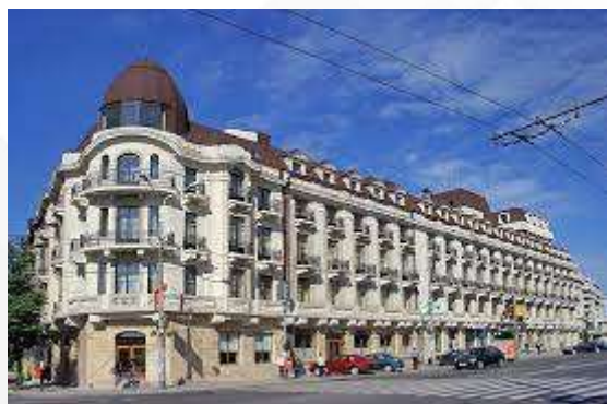
Hotel Central 4*