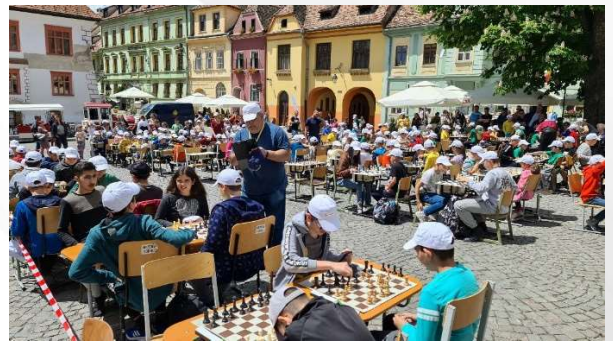
Chess event in downtown Sighisoara