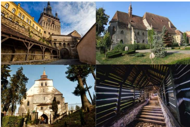
Medieval City of Sighisoara – birthplace of Vlad „Dracula”