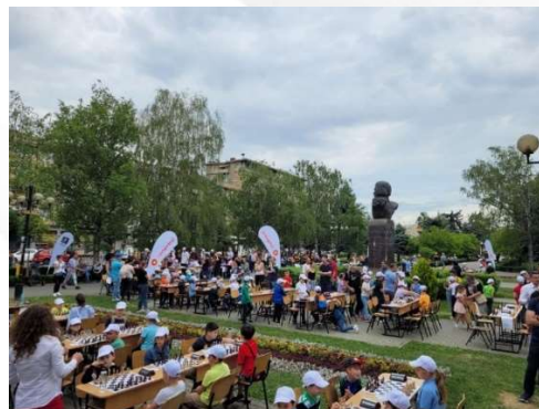
Kids event in downtown park